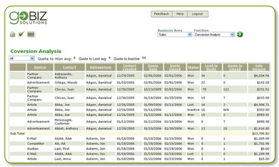
Sales Cycle Analysis